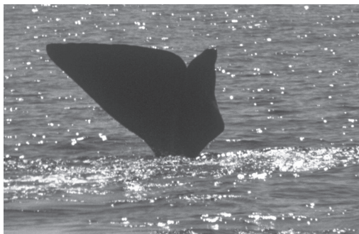
Figure 2. Photograph of an injured sperm whale sighted off the coast of Provence (France) in August 2003